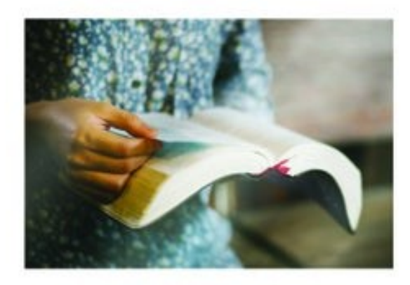
Excerpts from the Lectionary for Mass 52001, 1998, 1970 CCD. The English translation of Psalm Responses from Lectionary for Mass @ 1969, 1981, 1997, International Commission on English in the Liturgy Corporation. All rights reserved.

Sir 27:4-7/Ps 92:2-3, 13-14, 15-16 (see 2a)/ 1 Cor 15:54-58/Lk 6:39-45